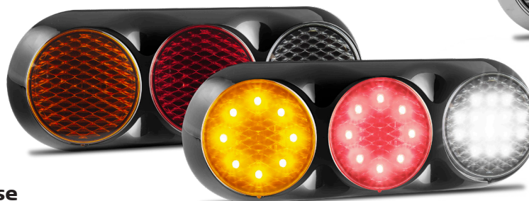
Stop/Tail/Indicator/Reverse 82BARW - 12 Volt, Single Blister, Coloured Lens 82BARWMB - 12-24V, Bulk, Coloured Lens