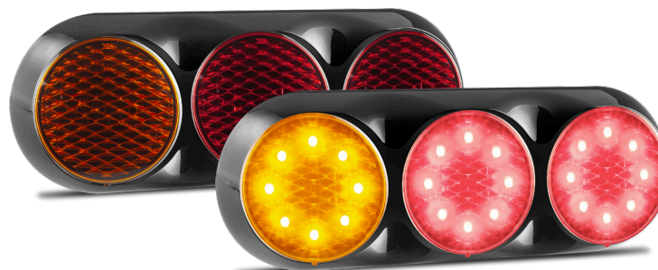
Stop/Tail/Indicator 82BARR - 12 Volt, Single Blister, Coloured Lens 82BARRMB - 12-24V, Bulk, Coloured Lens