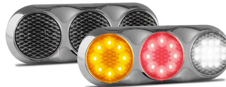
Stop/Tail/Indicator/Reverse 82CARW - Single Blister, Clear Lens