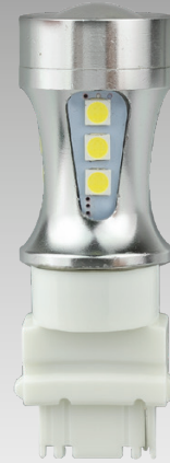
Part No. T20WM Reverse