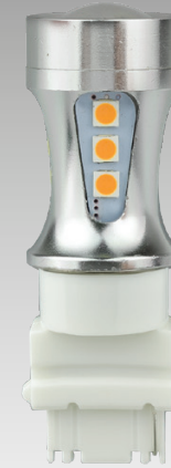
Part No. T20RM Stop/Tail