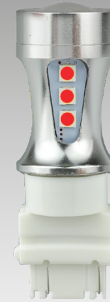
Part No. T20AM Indicator