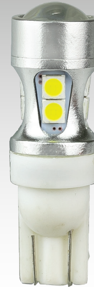
Part No. T10WM