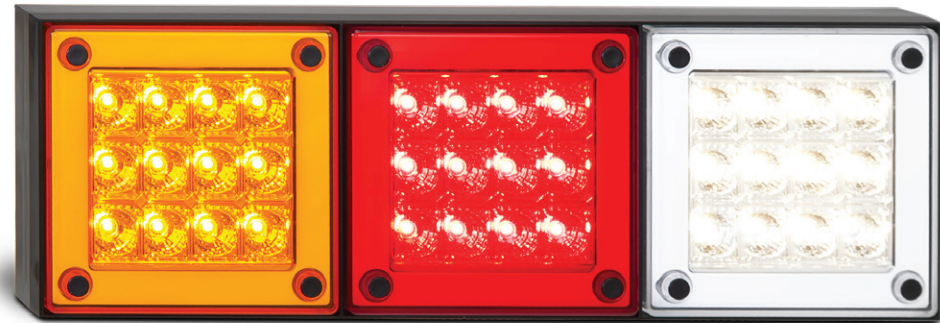
Stop/Tail/Indicator/Reverse 280ARWM - Blister, 12-24 Volt 280ARWMB - Box, 12-24 Volt