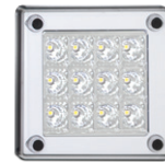
Part No. 280WM