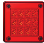
Part No. 280RM