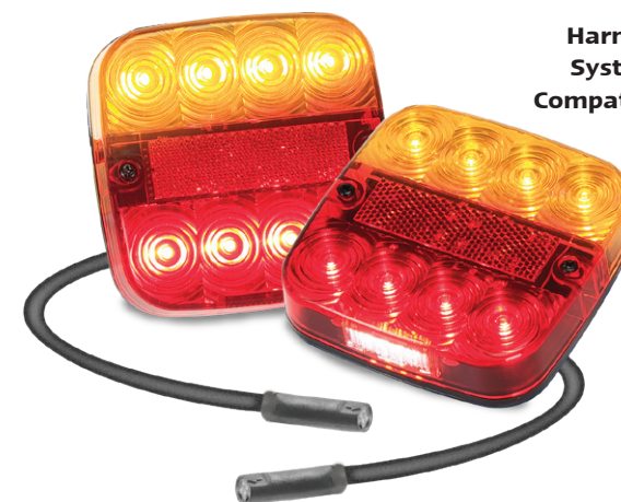
Harness System Compatibility