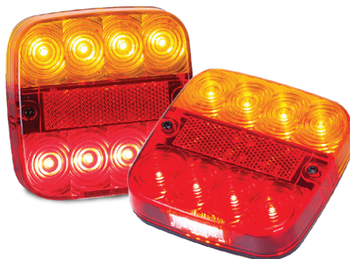
Stop/Tail/Indicator/Licence/Reflector, with 4 Pin Plug