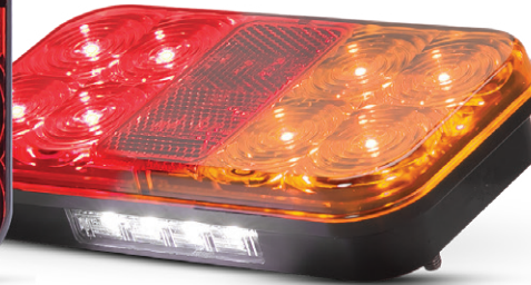
Horizontal Licence Lamp