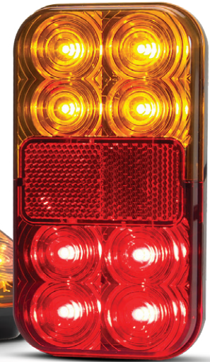
Vertical Licence Lamp