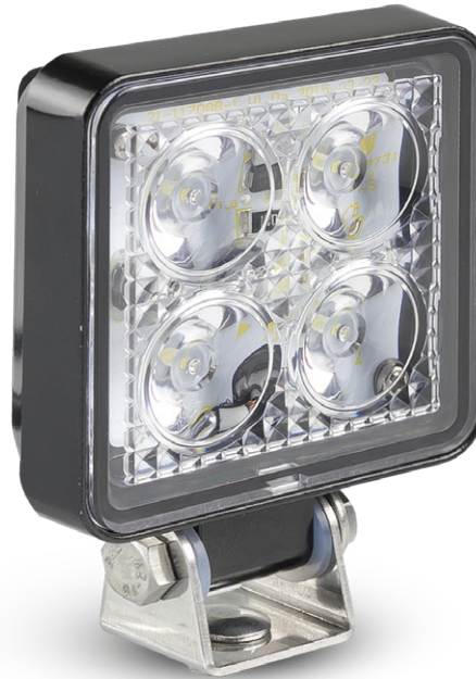
Reverse/Flood Lamp, Black E-Coated 7312BM - Blister