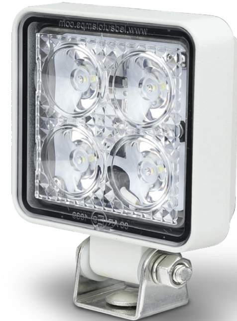
Reverse/Flood Lamp, White E-Coated 7312WM - Blister