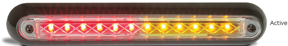
Stop/Tail/Indicator 235BBST112/2 - Twin Blister