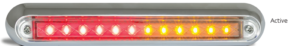
Stop/Tail/Indicator 235CWST112 - Single Bulk